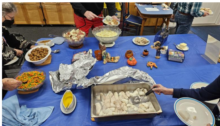
Members help themselves to buffet.