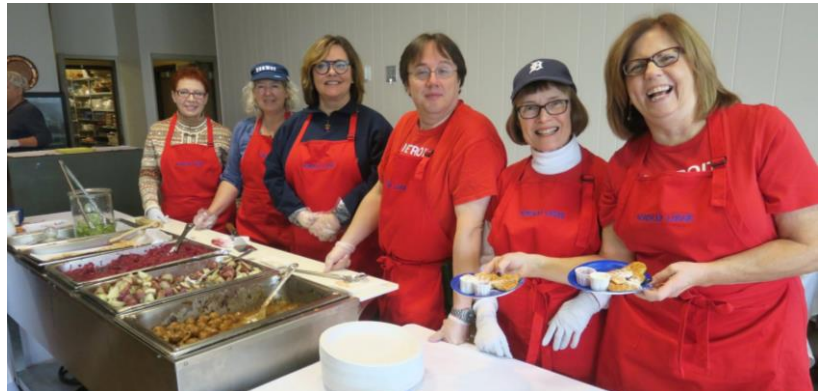
Nordkap volunteers serving at previous Scandinavian Market.

And, yes, please COME to be a volunteer at Nordkap's import store or meatball dinner.