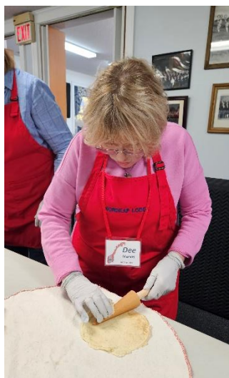
Roll on a tapered spindle.