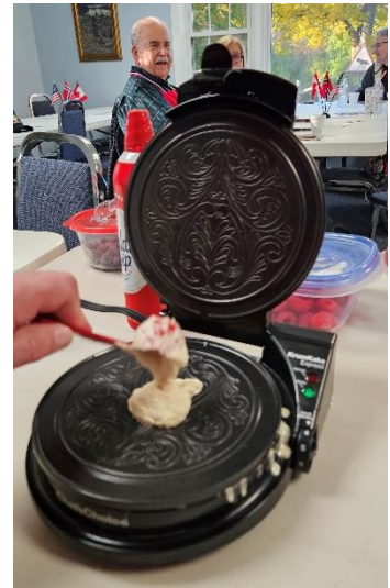
Batter goes into heated griddle.