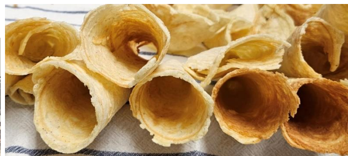
Finished krumkake awaiting filling.

Thanks to our five enthusiastic chefs for sharing their secrets for making this wonderful treat!