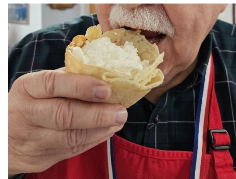
Eat delicious krumkake filled with fruit and whipped cream.