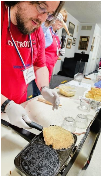
Grill for a few seconds.. ..before removing krumkake.