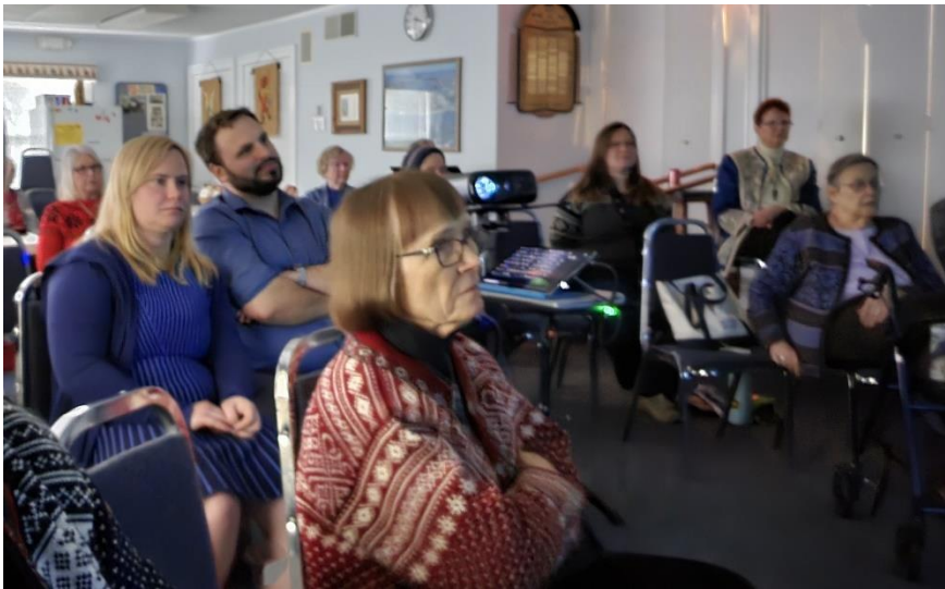
Paying rapt attention to the fantasy-adventure tale of a troll