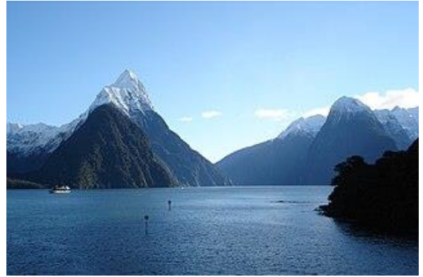
New Zealand's Milford Sound