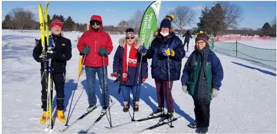
Previous ski outing at Huron Meadows Metropark

After Nordkap wraps up our event around noon, everyone's invited to Brewery Becker at 500 W. Main Street in Brighton to purchase ales and lagers, or non-alcoholic beverages. There's also a light food menu to choose from. Meet up with us at the brewpub around 1 p.m.