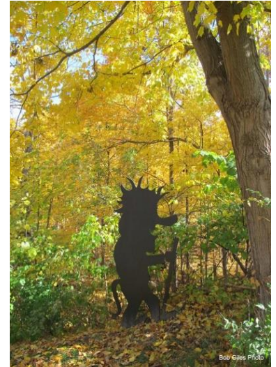
Olaf Oskar Smork

https://en.wikipedia.org/wiki/In_the_Hall_of_the_Mountain_King , https://www.youtube.com/watch?v=r_Dk4oWGJQ