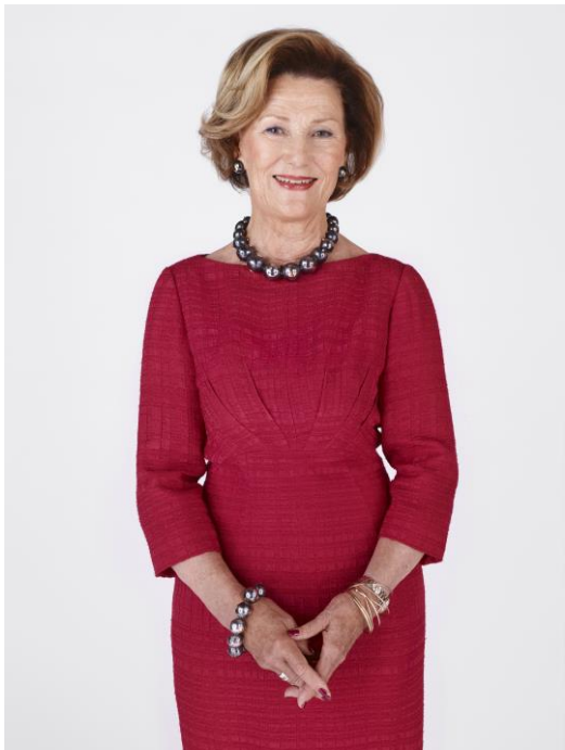
H.M. Queen Sonja

Just weeks ago, the disassembled 1930s childhood home of H.M. Queen Sonja of Norway was moved from its