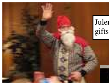
Julenisse leaves after delivering gifts to the good girls and boys