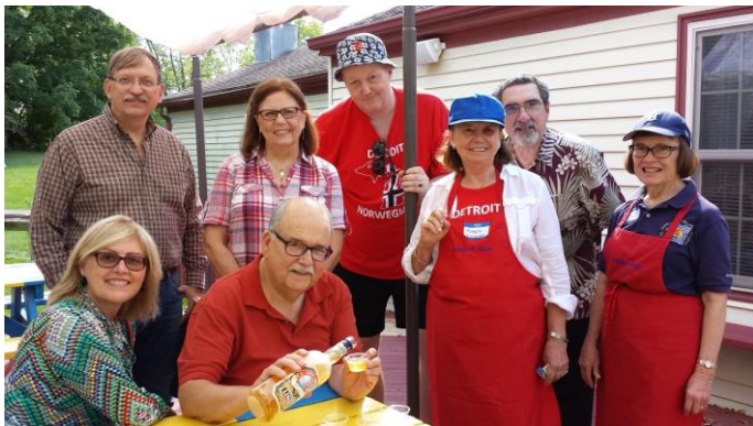
The clean-up crew enjoys a taste of Norwegian Linie Aquavit after a long day at the Steak and Corn Roast.

Also with fall comes the election—our lodge election, in this case. On October 23, we'll report the progress of our nominating committee in seeking new officer candidates. There is still time for you to help Nordkap reach its highest potential. Let us know how you would like to serve, and we'll find a position that meets your interests that you can run for. The elections will be held at our November 20 th gathering.