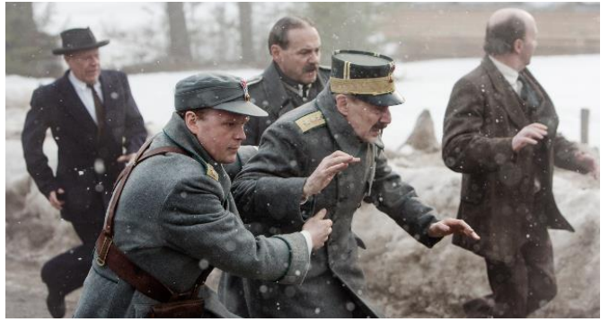
Scene from "The King's Choice"

Yes, it could, because the historical drama, "The King's Choice," is set to represent Norway in the race for foreign-language-film Oscar nominations at the 89th Academy Awards on February 26, 2017.