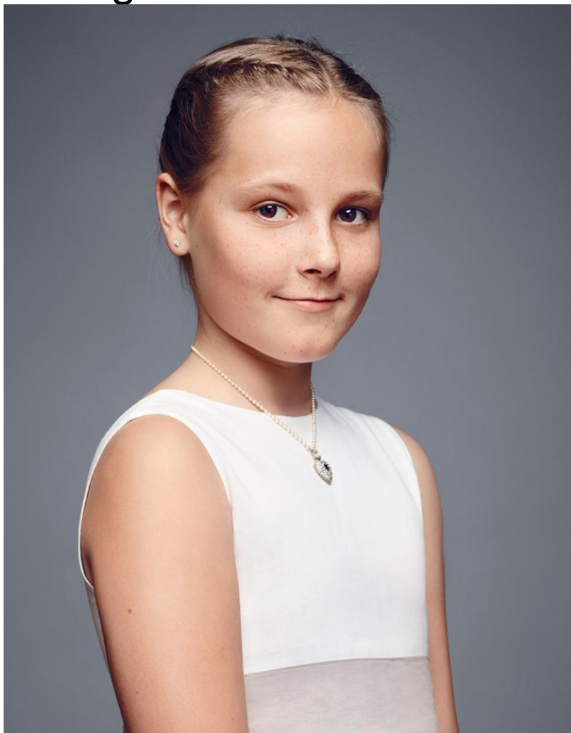
Her Royal Highness Ingrid Alexandra